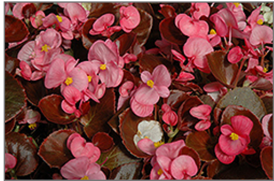
Nightife Rose Begonia flowers

Nightife Rose Begonia is recommended for the following landscape applications;