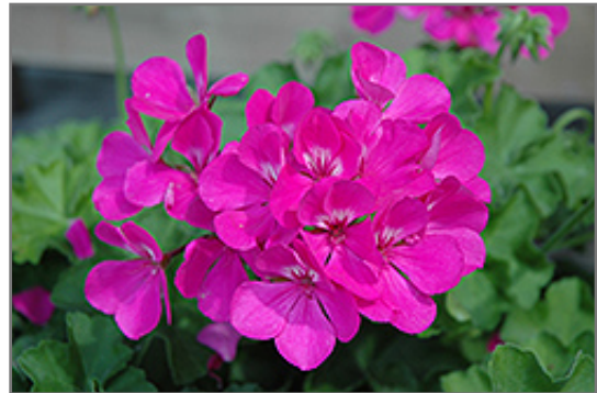
Caliente Lavender Geranium flowers