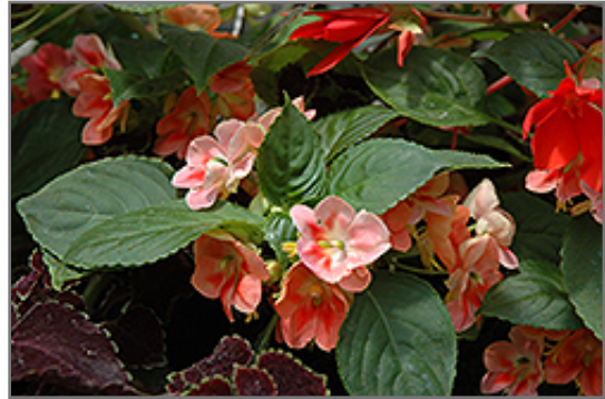
Fusion Heat Coral Impatiens flowers