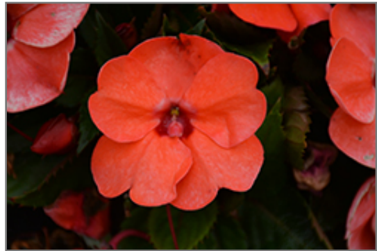
SunPatens Compact Hot Coral New Guinea Impatiens flowers

This plant will require occasional maintenance and upkeep, and should not require much pruning, except when necessary, such as to remove dieback. It is a good choice for attracting bees and butterflies to your yard. It has no significant negative characteristics.