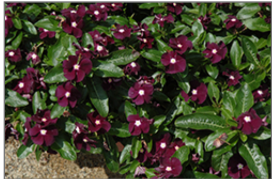
Jams 'N Jellies Blackberry Vinca flowers

Jams 'N Jellies Blackberry Vinca is recommended for the following landscape applications;