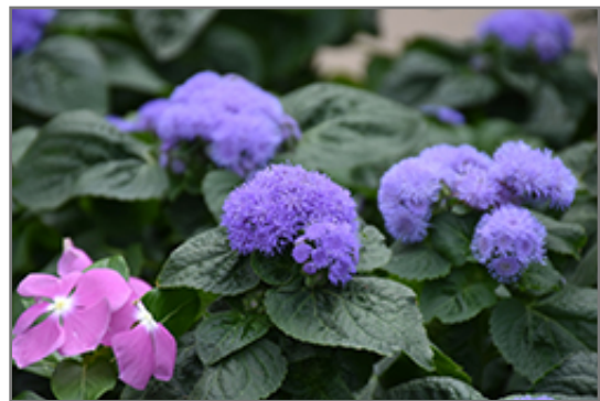
High Tide Blue Flossflower flowers