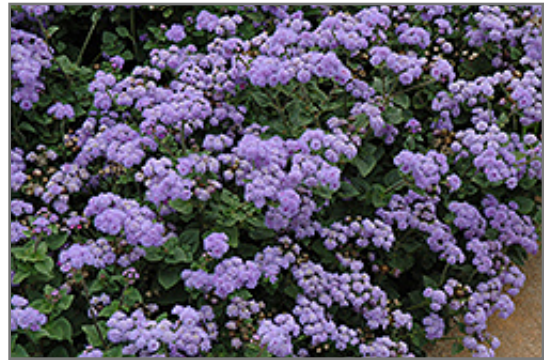
High Tide Blue Flossflower in bloom

High Tide Blue Flossflower will grow to be about 18 inches tall at maturity, with a spread of 16 inches. When grown in masses or used as a bedding plant, individual plants should be spaced approximately 12 inches apart. Its foliage tends to remain dense right to the ground, not requiring facer plants in front. This fast-growing annual will normally live for one full growing season, needing replacement the following year.