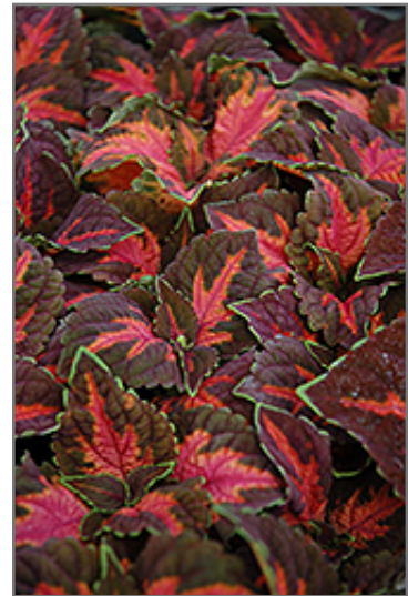
Superfine Rainbow Festive Dance Coleus foliage