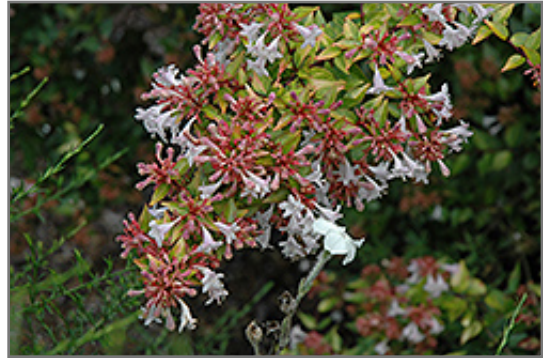
Francis Mason Abelia flowers

Francis Mason Abelia is recommended for the following landscape applications;