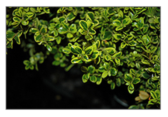
Golden Dream Boxwood foliage

Bandera Location 8516 Bandera Road San Antonio, TX 78250 (210) 680-2394