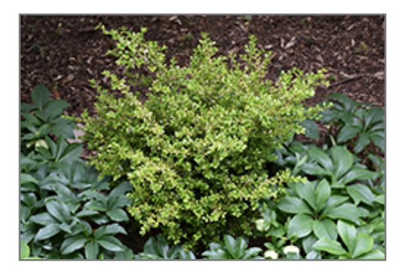
Golden Dream Boxwood

Golden Dream Boxwood is recommended for the following landscape applications;