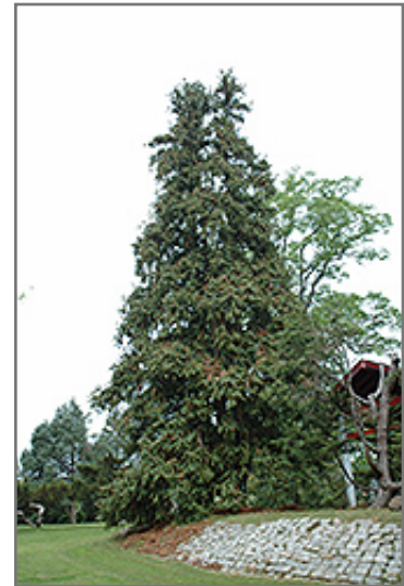
China Fir

China Fir will grow to be about 70 feet tall at maturity, with a spread of 40 feet. It has a low canopy, and should not be planted underneath power lines. It grows at a slow rate, and under ideal conditions can be expected to live for 40 years or more.