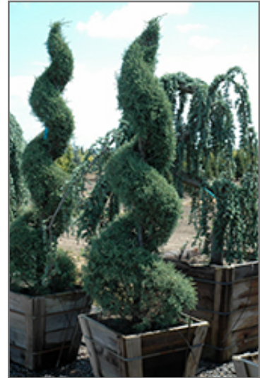
Carolina Sapphire Arizona Cypress

This tree should only be grown in full sunlight. It prefers dry to average moisture levels with very well-drained soil, and will often die in standing water. It is considered to be drought-tolerant, and thus makes an ideal choice for xeriscaping or the moisture-conserving landscape. It is not particular as to soil pH, but grows best in sandy soils. It is somewhat tolerant of urban pollution. This is a selection of a native North American species.