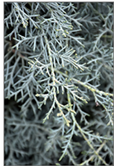
Carolina Sapphire Arizona Cypress foliage