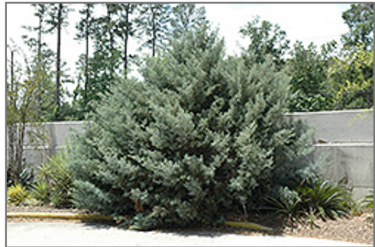
Carolina Sapphire Arizona Cypress

Carolina Sapphire Arizona Cypress is recommended for the following landscape applications;