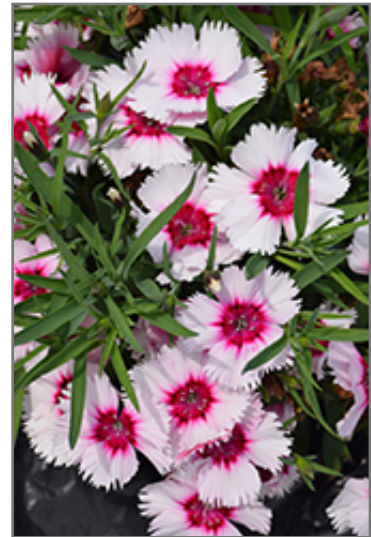
Super Parfait Raspberry Pinks flowers

Super Parfait Raspberry Pinks is a fine choice for the garden, but it is also a good selection for planting in outdoor pots and containers. It is often used as a 'filler' in the 'spiller-thriller-filler' container combination, providing a mass of flowers and foliage against which the thriller plants stand out. Note that when growing plants in outdoor containers and baskets, they may require more frequent waterings than they would in the yard or garden.