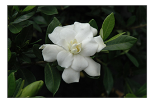
Double Mint Gardenia flowers

Bandera Location 8516 Bandera Road San Antonio, TX 78250 (210) 680-2394