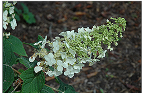
Ellen Huff Hydrangea flowers

Ellen Huff Hydrangea will grow to be about 8 feet tall at maturity, with a spread of 10 feet. It tends to be a little leggy, with a typical clearance of 1 foot from the ground, and is suitable for planting under power lines. It grows at a slow rate, and under ideal conditions can be expected to live for approximately 30 years.