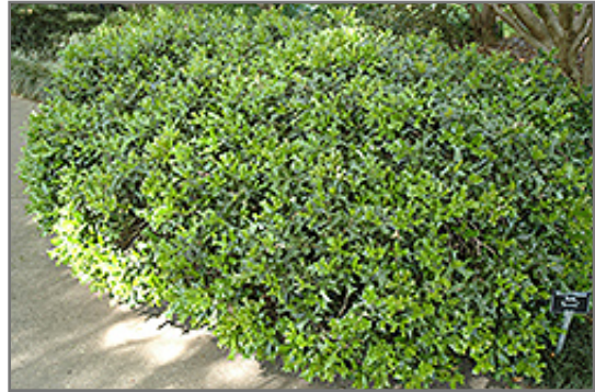
Rotunda Chinese Holly