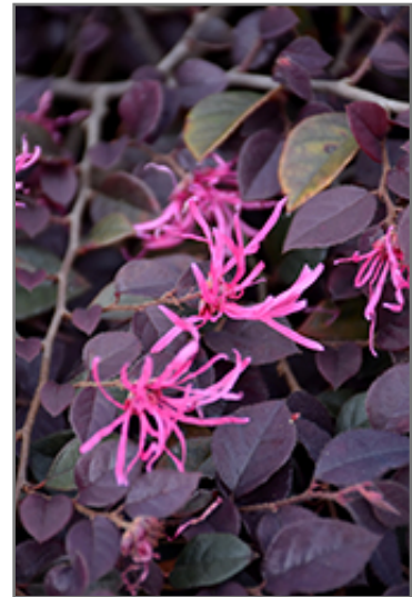
Crimson Fire Chinese Fringeflower flowers

Crimson Fire Chinese Fringeflower is recommended for the following landscape applications;