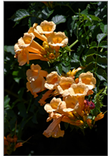
Yellow Trumpetvine flowers