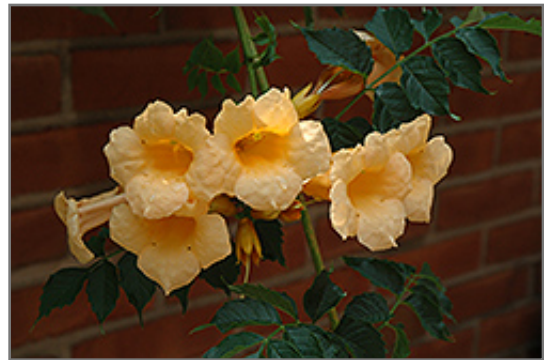
Yellow Trumpetvine flowers