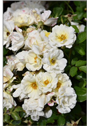
White Drift Rose flowers

White Drift Rose is recommended for the following landscape applications;