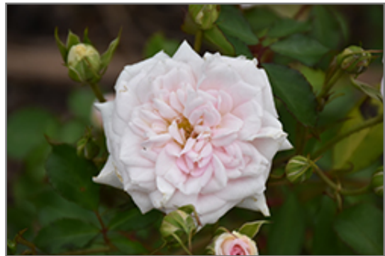
White Drift Rose flowers