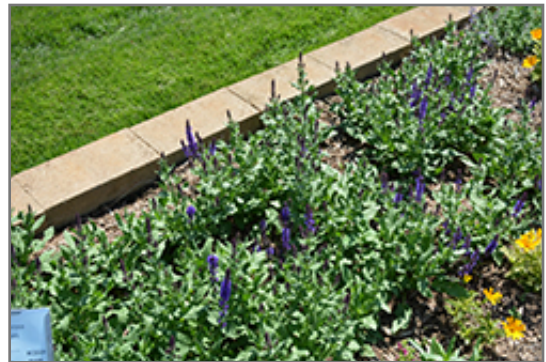
Lyrical Blues Meadow Sage in bloom