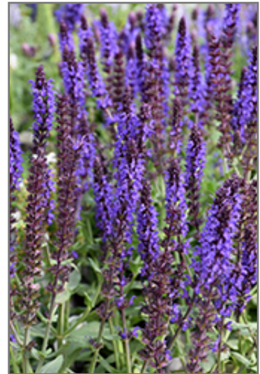
Lyrical Blues Meadow Sage flowers

This is a relatively low maintenance plant, and is best cleaned up in early spring before it resumes active growth for the season. It is a good choice for attracting butterflies and hummingbirds to your yard, but is not particularly attractive to deer who tend to leave it alone in favor of tastier treats. It has no significant negative characteristics.