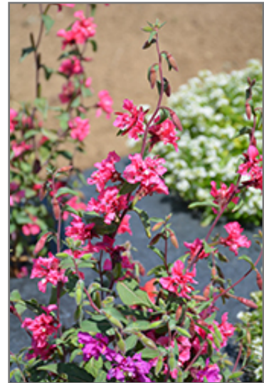
Sriracha Rose Cuphea flowers