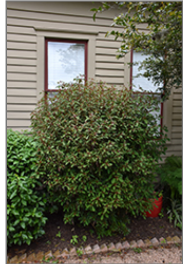
Scarlet Bush

Scarlet Bush makes a fine choice for the outdoor landscape, but it is also well-suited for use in outdoor pots and containers. Because of its height, it is often used as a 'thriller' in the 'spiller-thriller-filler' container combination; plant it near the center of the pot, surrounded by smaller plants and those that spill over the edges. It is even sizeable enough that it can be grown alone in a suitable container. Note that when grown in a container, it may not perform exactly as indicated on the tag - this is to be expected. Also note that when growing plants in outdoor containers and baskets, they may require more frequent waterings than they would in the yard or garden.