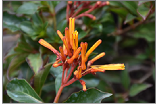
Scarlet Bush flowers

Scarlet Bush is a multi-stemmed evergreen shrub with a more or less rounded form. Its average texture blends into the landscape, but can be balanced by one or two finer or coarser trees or shrubs for an effective composition.