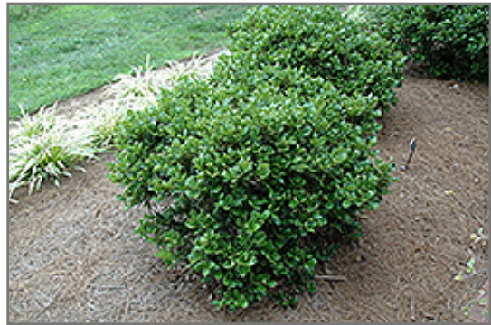
Carissa Holly

Carissa Holly is recommended for the following landscape applications;