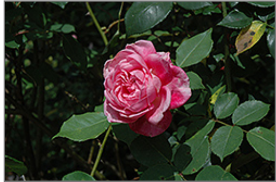
Mrs. B.R. Cant Rose flowers