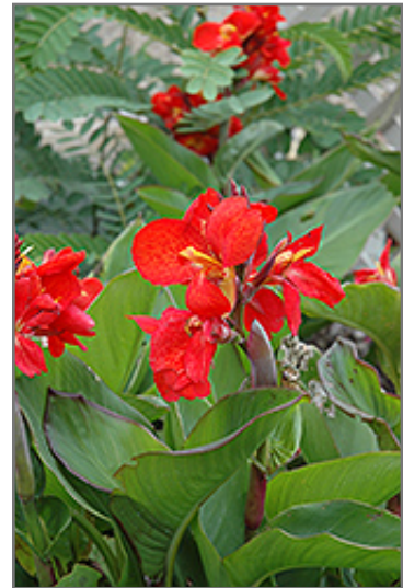
Tropical Red Canna flowers

This plant should only be grown in full sunlight. It requires an evenly moist well-drained soil for optimal growth, but will die in standing water. It may require supplemental watering during periods of drought or extended heat. It is not particular as to soil pH, but grows best in rich soils. It is highly tolerant of urban pollution and will even thrive in inner city environments, and will benefit from being planted in a relatively sheltered location. Consider applying a thick mulch around the root zone in winter to protect it in exposed locations or colder microclimates. This particular variety is an interspecific hybrid. It can be propagated by division; however, as a cultivated variety, be aware that it may be subject to certain restrictions or prohibitions on propagation.