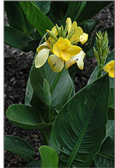
Tropicanna Yellow Canna flowers

This plant should only be grown in full sunlight. It requires an evenly moist well-drained soil for optimal growth, but will die in standing water. It may require supplemental watering during periods of drought or extended heat. It is not particular as to soil pH, but grows best in rich soils. It is highly tolerant of urban pollution and will even thrive in inner city environments, and will benefit from being planted in a relatively sheltered location. Consider applying a thick mulch around the root zone in winter to protect it in exposed locations or colder microclimates. This particular variety is an interspecific hybrid. It can be propagated by division; however, as a cultivated variety, be aware that it may be subject to certain restrictions or prohibitions on propagation.