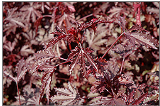
Haight Ashbury Hibiscus foliage