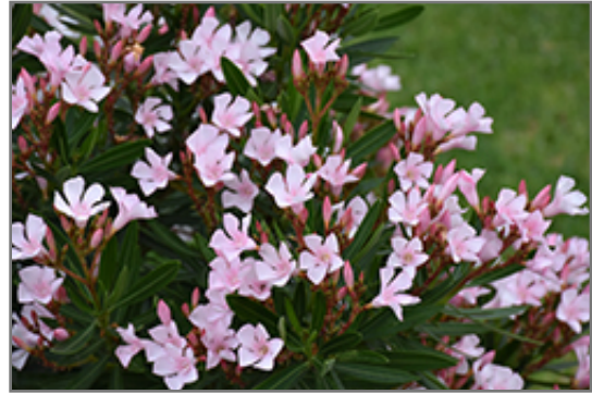
Petite Pink Oleander flowers

Petite Pink Oleander is recommended for the following landscape applications;