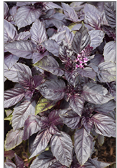
Red Rubin Basil foliage

Red Rubin Basil will grow to be about 16 inches tall at maturity, with a spread of 12 inches. When grown in masses or used as a bedding plant, individual plants should be spaced approximately 10 inches apart. This fast-growing annual will normally live for one full growing season, needing replacement the following year.