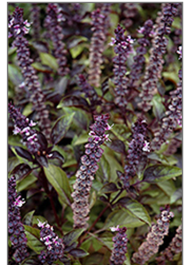
Red Rubin Basil flowers