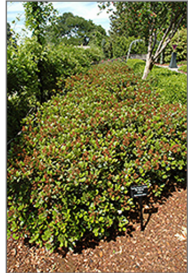
Spring Sonata Indian Hawthorn

Spring Sonata Indian Hawthorn will grow to be about 4 feet tall at maturity, with a spread of 5 feet. It has a low canopy with a typical clearance of 1 foot from the ground. It grows at a medium rate, and under ideal conditions can be expected to live for approximately 20 years.