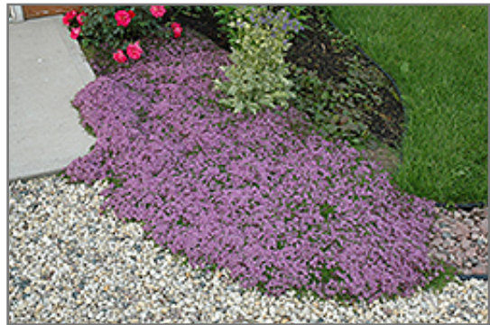
Red Creeping Thyme in bloom