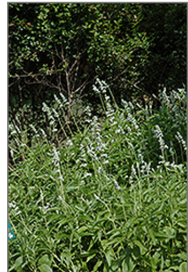
Augusta Duelberg Salvia in bloom