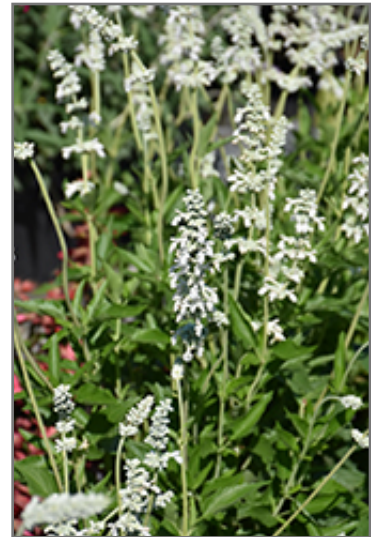
Augusta Duelberg Salvia flowers

Augusta Duelberg Salvia is recommended for the following landscape applications;