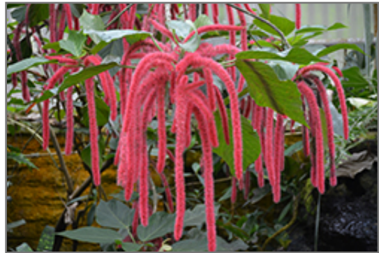
Firetail Chenille Plant flowers