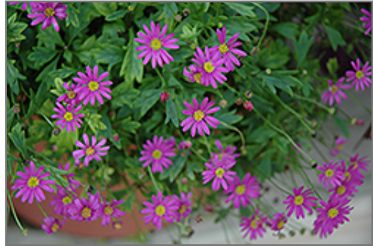
Radiant Magenta Brachyscome flowers

Other Names: Swan River Daisy, Brachyscome