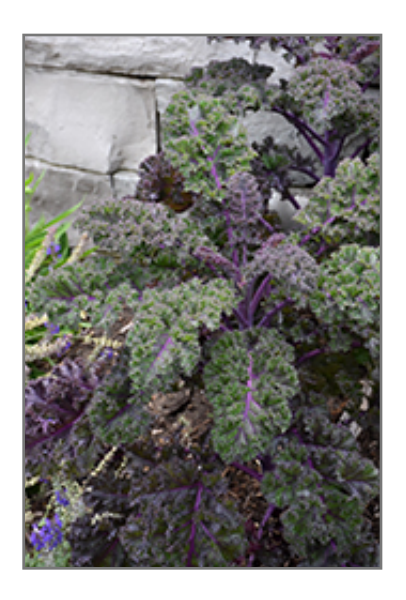
Redbor Kale foliage