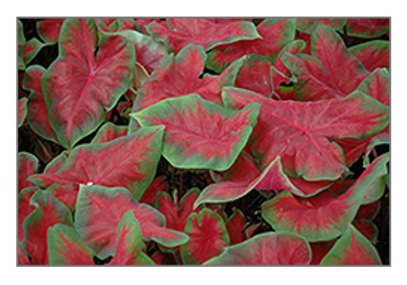
Frieda Hemple Caladium foliage