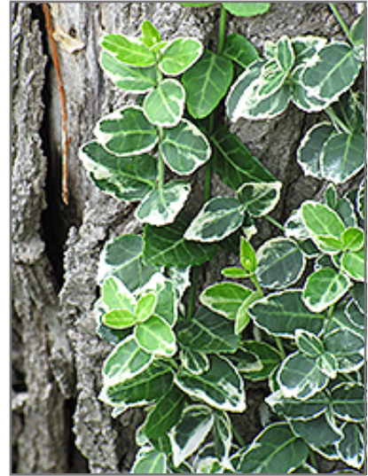
Emerald Gaiety Wintercreeper foliage

Emerald Gaiety Wintercreeper is recommended for the following landscape applications;