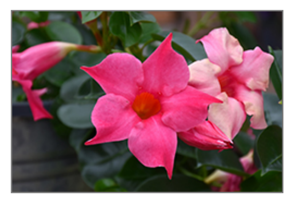
Pink Mandevilla flowers

This plant is native to the tropics and prefers growing in moist environments with evenly warm conditions all year round. In our climate, it is usually grown as an outdoor annual in the garden or in a container. If you want it to survive the winter, it can be brought in to the house and provided with special care, and then returned to the garden the following season. In its preferred tropical habitat, as a shrub it can grow to be around 10 feet tall at maturity, with a spread of 24 inches. However, when grown as an annual or when overwintered indoors, it can be expected to perform quite differently, and its exact height and spread will depend on many factors; you may wish to consult with our experts as to how it might perform in your specific application and growing conditions.