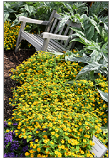
Showstar Melampodium in bloom