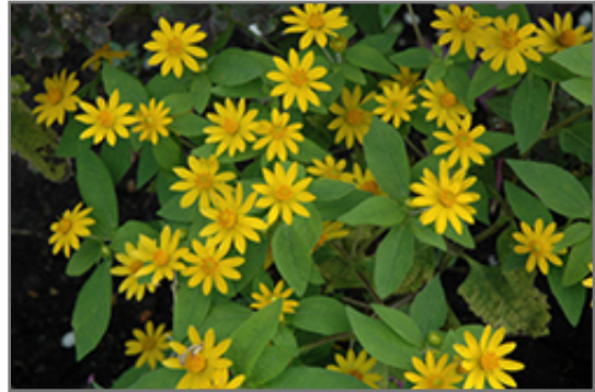
Showstar Melampodium flowers

Showstar Melampodium is recommended for the following landscape applications;