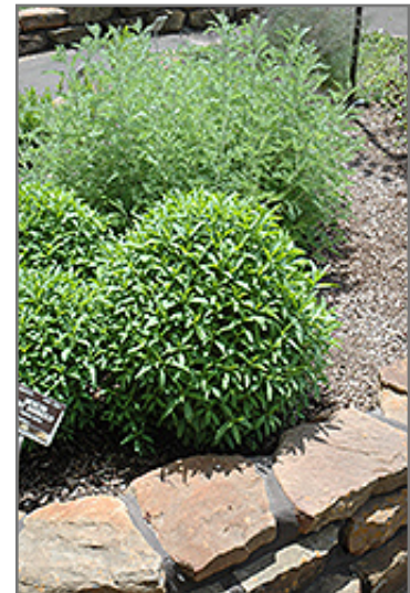
Mexican Tarragon