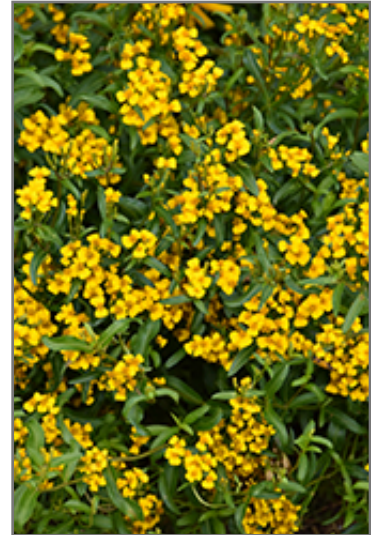
Mexican Tarragon flowers

Mexican Tarragon features showy yellow daisy flowers with gold eyes at the ends of the stems from late summer to early fall. Its attractive fragrant narrow compound leaves remain green in color throughout the season.