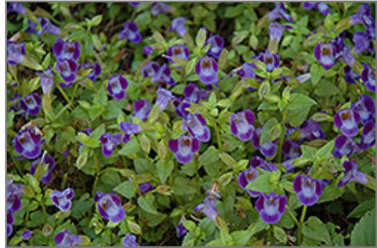
Wishbone Flower flowers