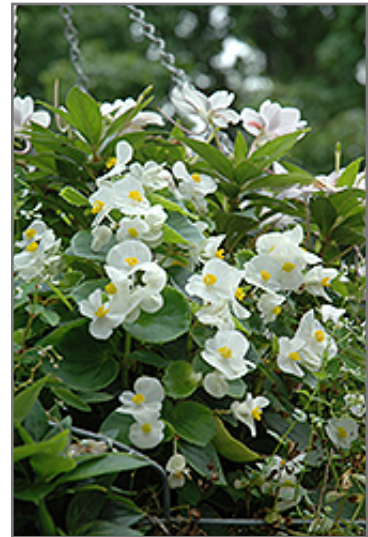
Wax Begonia flowers

An outstanding begonia with nicely rounded glossy green leaves for a visual impact in the garden; clusters of white, pink, red, or bi-color blooms rise above the foliage all season; grows well in humid conditions