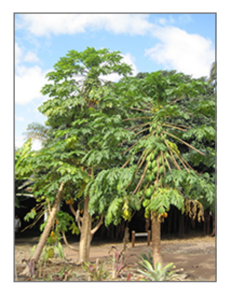
Papaya fruit

Bandera Location 8516 Bandera Road San Antonio, TX 78250 (210) 680-2394