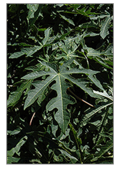
Papaya will grow to be about 20 feet tall at maturity, with a spread of 10 feet. It has a low canopy with a typical clearance of 3 feet from the ground, and is suitable for planting under power lines. It grows at a fast rate, and under ideal conditions can be expected to live for approximately 10 years.