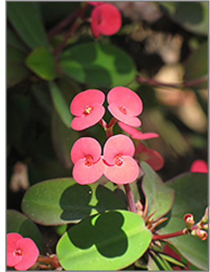
Crown Of Thorns flowers

Crown Of Thorns is recommended for the following landscape applications;