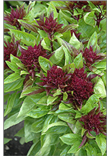
Cardinal Basil flowers

This plant is quite ornamental as well as edible, and is as much at home in a landscape or flower garden as it is in a designated herb garden. It should only be grown in full sunlight. It prefers to grow in average to moist conditions, and shouldn't be allowed to dry out. It may require supplemental watering during periods of drought or extended heat. It is not particular as to soil type or pH. It is somewhat tolerant of urban pollution. This is a selected variety of a species not originally from North America. It can be propagated by cuttings; however, as a cultivated variety, be aware that it may be subject to certain restrictions or prohibitions on propagation.