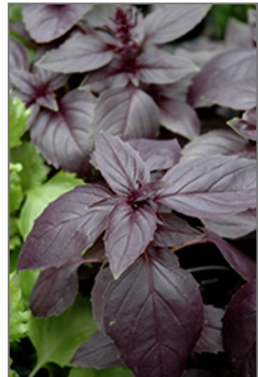
Red Rosie Basil foliage