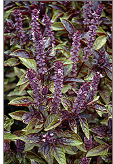
Red Rosie Basil flowers

Red Rosie Basil will grow to be about 18 inches tall at maturity extending to 24 inches tall with the flowers, with a spread of 16 inches. When grown in masses or used as a bedding plant, individual plants should be spaced approximately 12 inches apart. This fast-growing annual will normally live for one full growing season, needing replacement the following year.