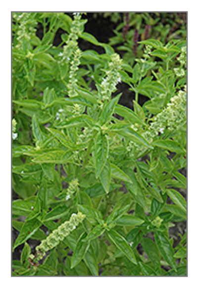
Sweet Italian Basil flowers

Thousand Oaks Location 2585 Thousand Oaks San Antonio, TX 78232 (210) 494-6131