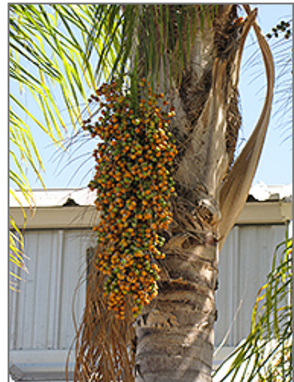
Queen Palm fruit

Bandera Location 8516 Bandera Road San Antonio, TX 78250 (210) 680-2394