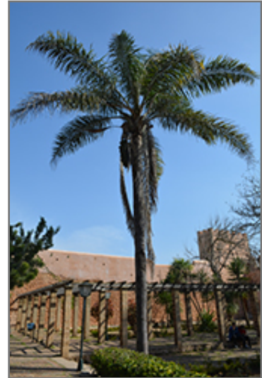
Queen Palm

Queen Palm is recommended for the following landscape applications;