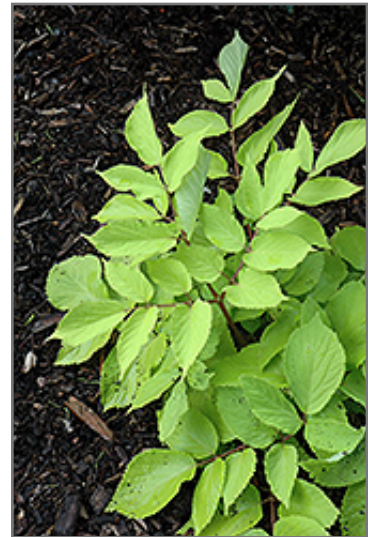
Sun King Japanese Spikenard foliage

This plant performs well in both full sun and full shade. It prefers to grow in average to moist conditions, and shouldn't be allowed to dry out. It may require supplemental watering during periods of drought or extended heat. It is not particular as to soil type or pH. It is highly tolerant of urban pollution and will even thrive in inner city environments. This is a selected variety of a species not originally from North America.