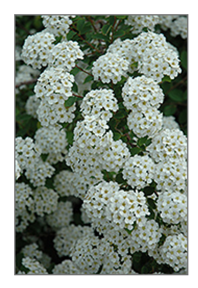
Renaissance Spirea flowers

Bandera Location 8516 Bandera Road San Antonio, TX 78250 (210) 680-2394