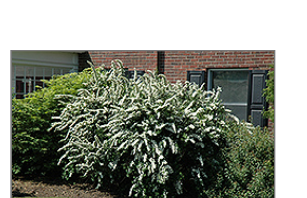
Renaissance Spirea in bloom