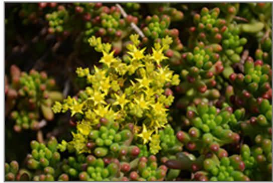
Jelly Bean Plant flowers

Jelly Bean Plant will grow to be only 5 inches tall at maturity, with a spread of 14 inches. When grown in masses or used as a bedding plant, individual plants should be spaced approximately 10 inches apart. Its foliage tends to remain low and dense right to the ground. It grows at a medium rate, and under ideal conditions can be expected to live for approximately 10 years. As an evergreen perennial, this plant will typically keep its form and foliage year-round.